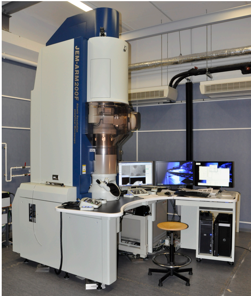
A really large electron microscope