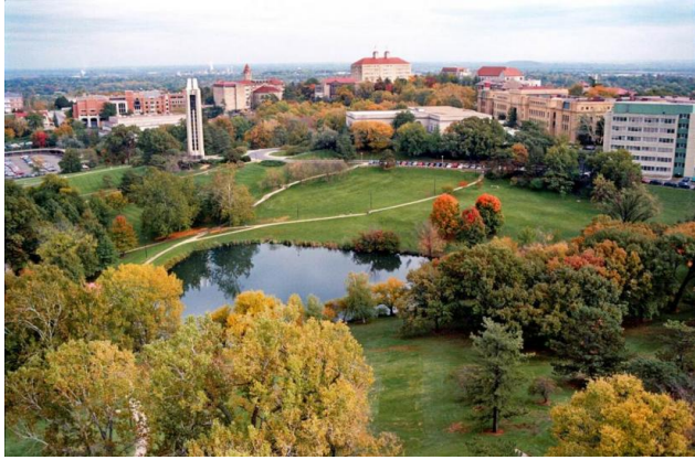
This is the University of Kansas. It's on a tall hill even though everyone thinks Kansas is flat.

college. I applied to graduate school, which is a fancy term for college after you already have one degree. Going to graduate school for things like science, engineering, technology, and math is very different from college because it's like having a job. Instead of paying to go to school, if you get in to the school, the school pays you and aside from taking classes you teach students and help professors (teachers) with their research projects.