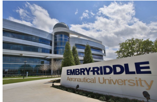
This is a picture of my college. There's a telescope in that dome on top of the building.

It was great to hear back from you! I'm glad you liked your letter. You are my only pen pal. My favorite Disney movie is The Little Mermaid because I love to sing. My two favorite animals in the world are red pandas and narwhals. I feel like I wouldn't need to mix any animals together to make a new one because the red panda is like a fox-raccoon-cat and the narwhal is like a whale-unicorn. We have a zoo here that has red pandas so I like to go there. I think our zoo is about the same as yours, although we don't have kangaroos or aquariums. I have been to Disney World, partly because I went to college in Daytona Beach, Florida, which is very close to Orlando and Disney World.