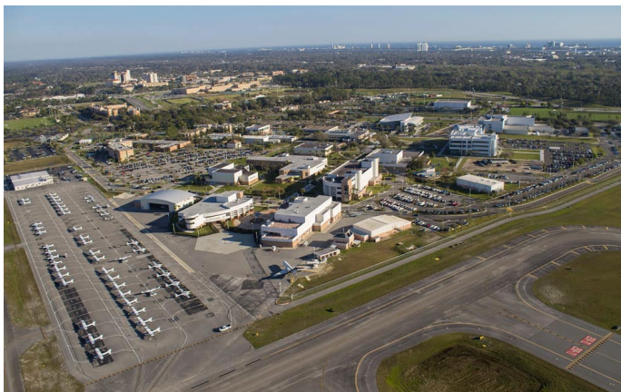
This is Embry-Riddle from above. Those planes on the left are the planes students use to learn to be pilots, and in the distance is the Atlantic Ocean.

My college was called Embry-Riddle Aeronautical University, which is a whole mouthful. It is called 'aeronautical' because many people go there to study how to be a pilot, how to fix airplanes, how to build rockets, and many other things having to do with the sky such as weather and outer space.